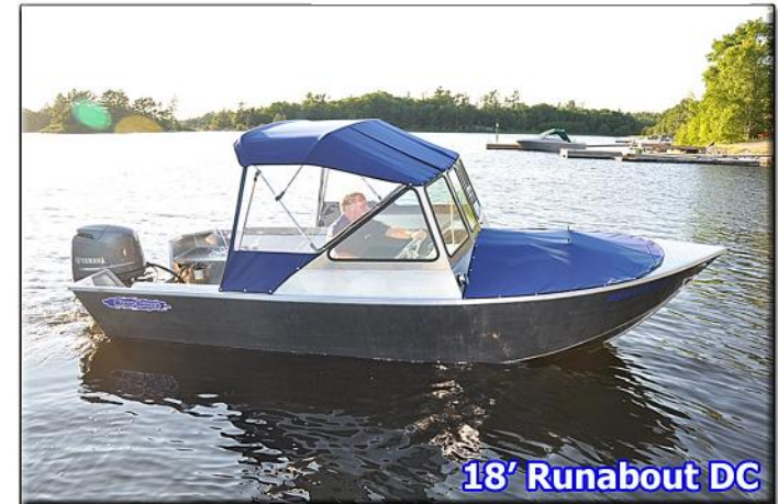
18' Runabout DC